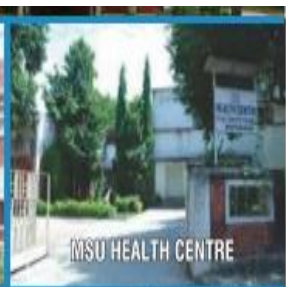
MSU HEALTH CENTRE