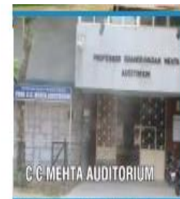
C C MEHTA AUDITORIUM