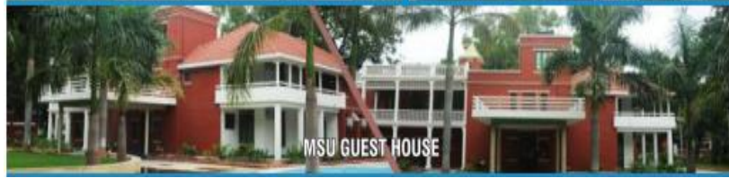
MSU GUEST HOUSE